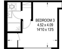
SECOND FLOOR 18.6 SQ M / 200 SQ FT

Illustration for identification purposes only, measurements are approximate, not to scale.